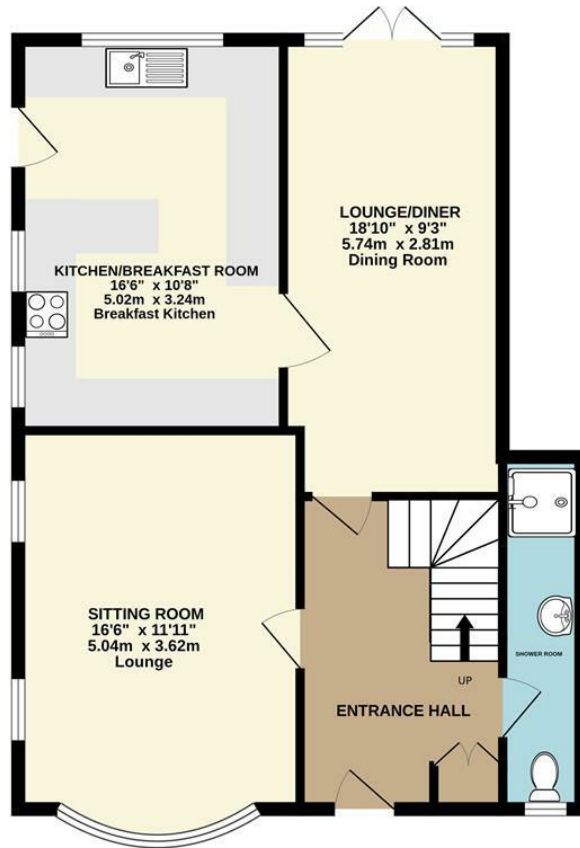
GROUND FLOOR 686 sq.ft. (63.7 sq.m.) approx.